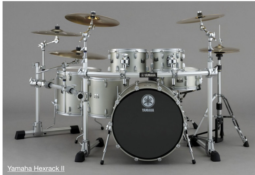
Yamaha Hexrack II

There is an alternative to mounting drums and cymbals on stands: a frame-like structure called a drum rack. Racks can offer a compact way to mount multiple toms and cymbals using the least floor space.