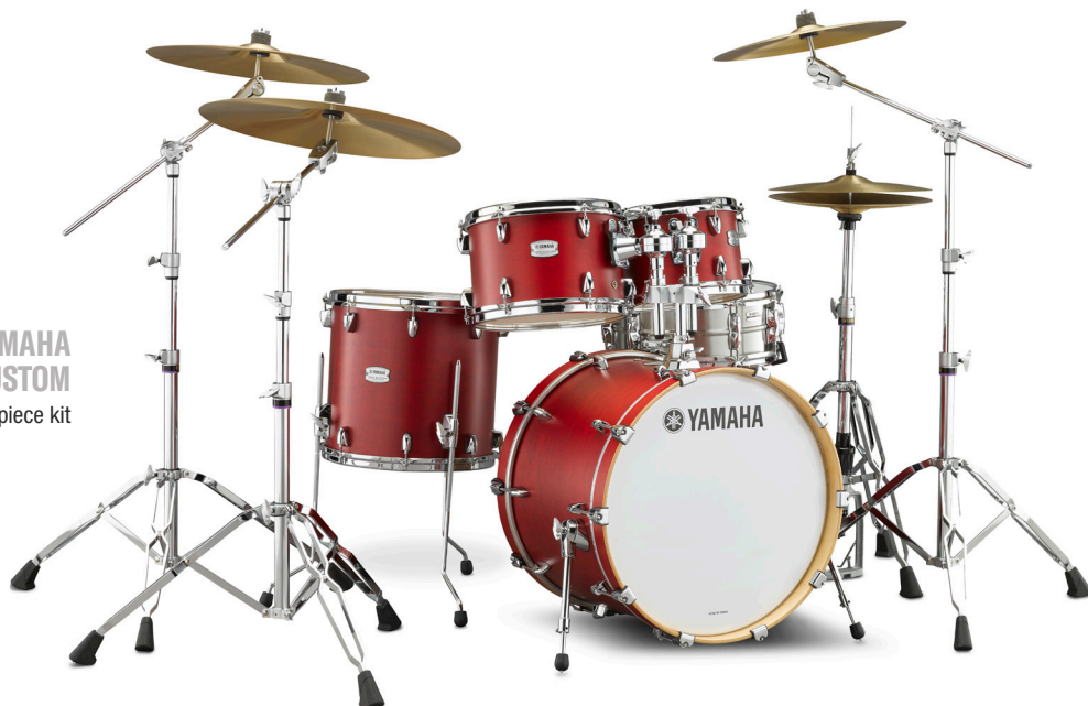
YAMAHA TOUR CUSTOM A typical 5-piece kit